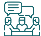
Patient education materials